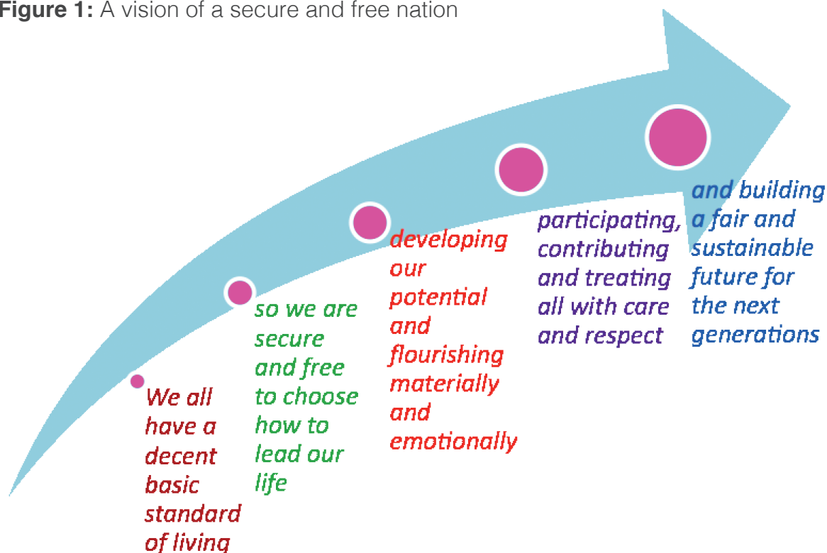
Figure 1: A vision of a secure and free nation

To conclude, readers are warmly invited to join the consensus building. This is done by asking: